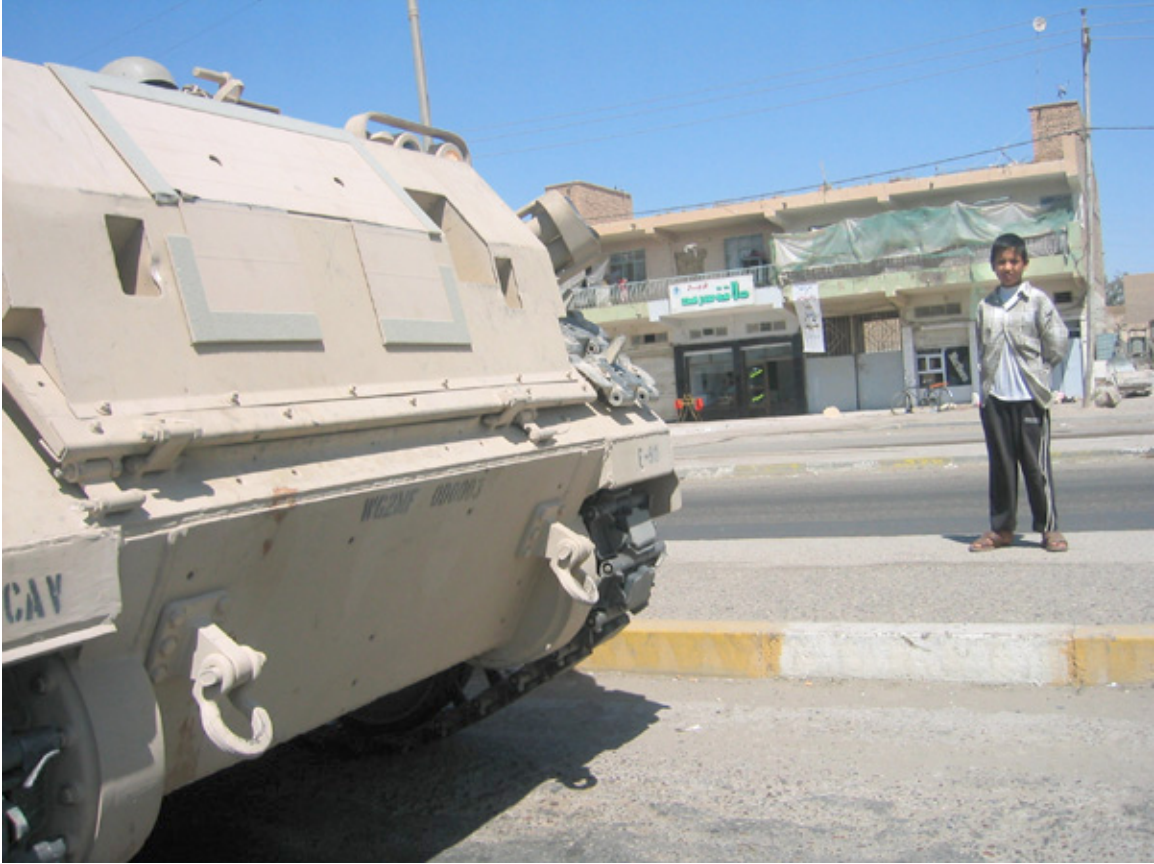
A boy in al-Falluja stands near a US military vehicle.