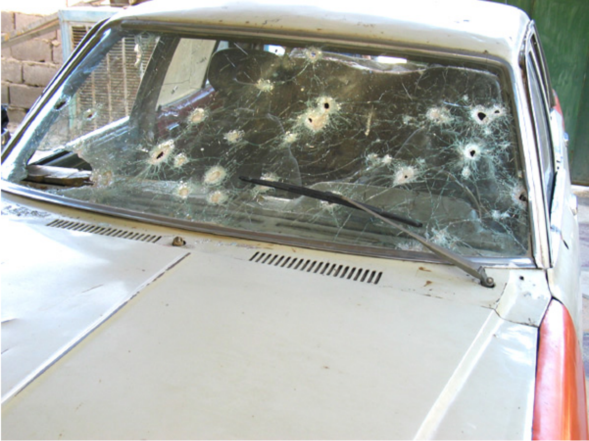
A car shot-up by US soldiers during the protest on April 28, 2003. The US military claimed that gunmen were using the car as cover, but protesters denied that any of them had opened fire.