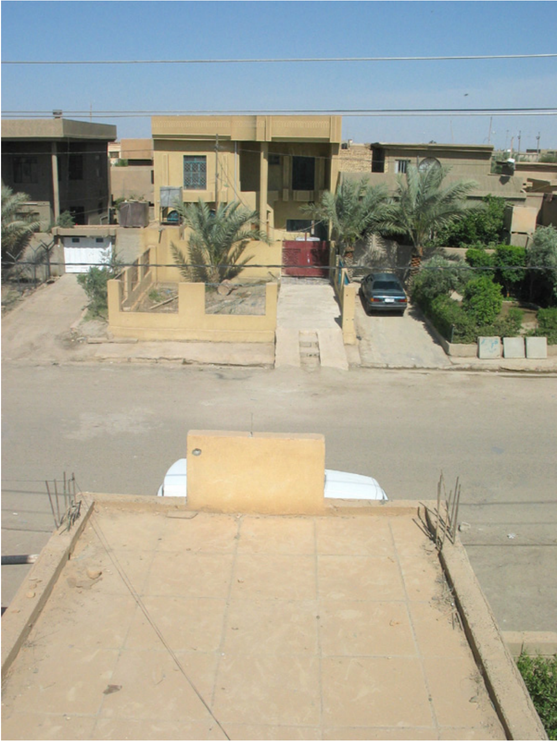
The al-Qa'id primary school in al-Falluja, the site of the April 28th demonstration.