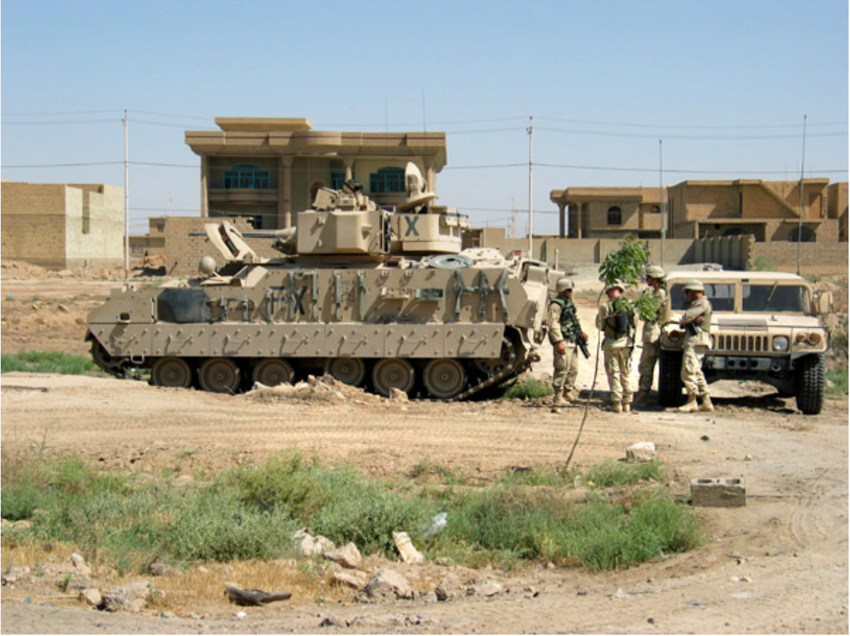
U.S. soldiers from the 3rd Armored Cavalry Regiment man a checkpoint in al-Falluja.