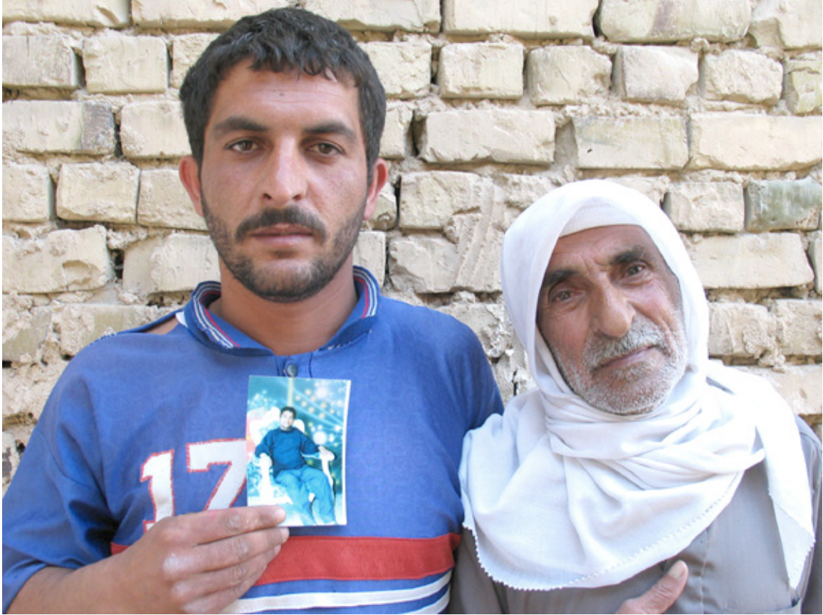
This father and son hold a photograph of their son and brother who was killed on April 28, 2003, by US troops.