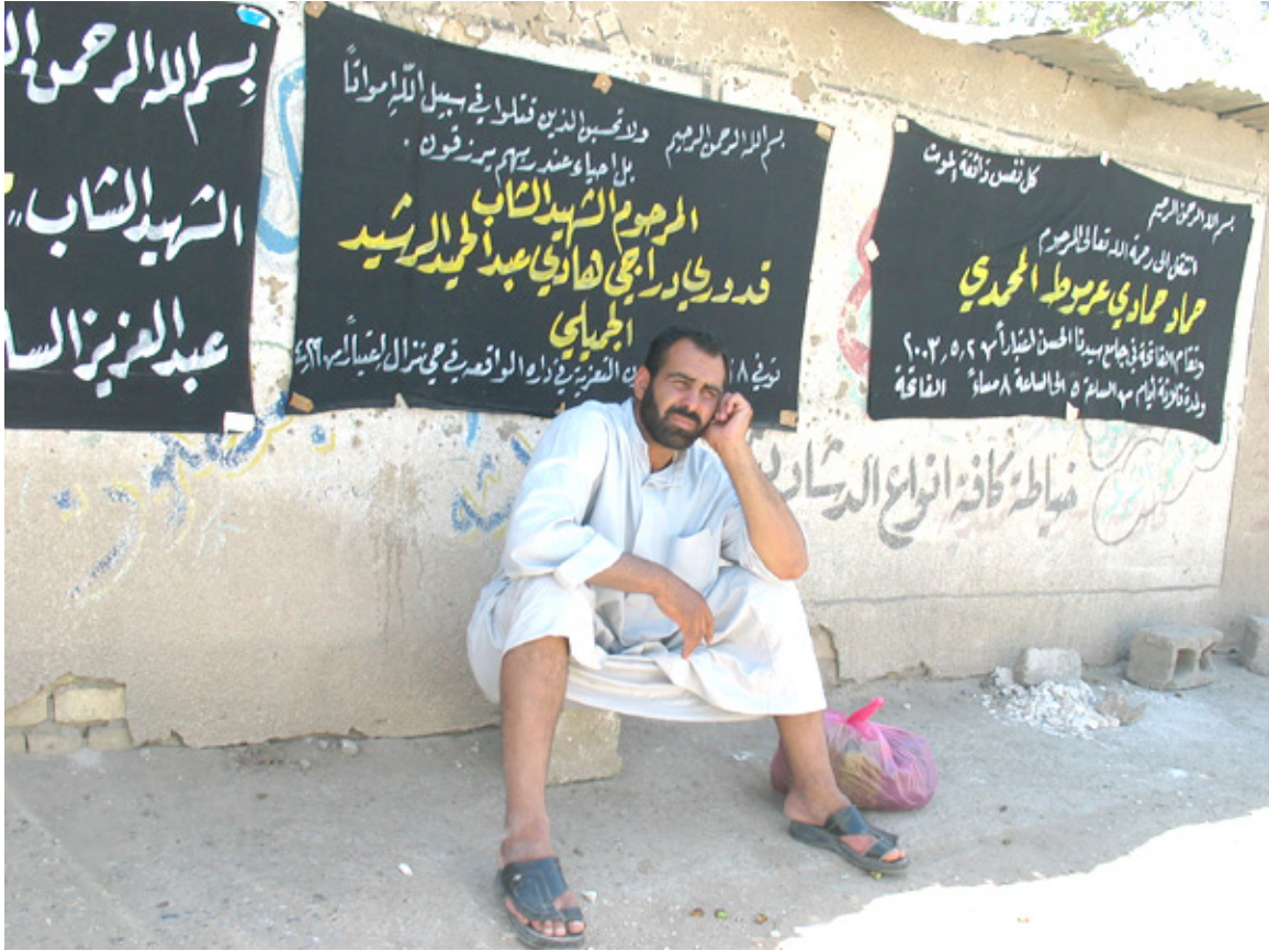
An al-Falluja man sits in front of death announcements for those killed in the April 28 th and April 30 th demonstrations.