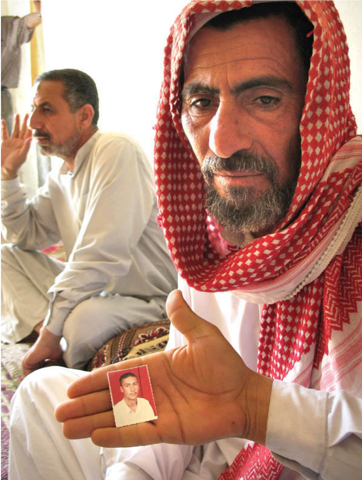
An al-Falluja man with a photograph of his son, killed by US troops during the April 28th demonstration.