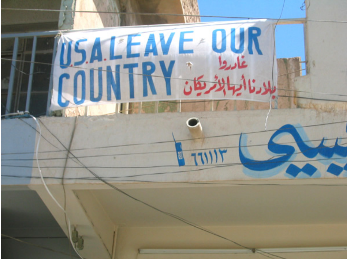
Anti-American banners like this one hang on al-Falluja's main street.