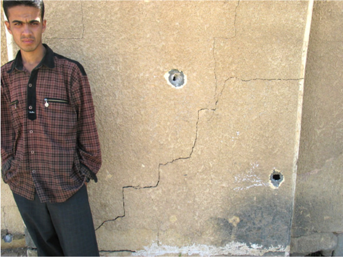
An al-Falluja resident stands next to the bullet impact mark on a wall across the street from the al-Qa'id school, where U.S. soldiers were based.